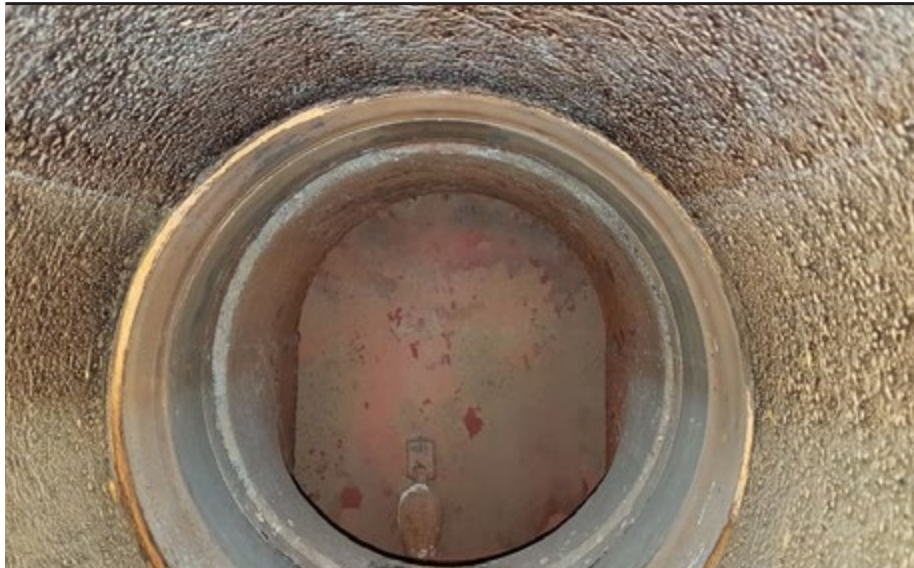
Suction tube, internal coating after 10 years of operation - Image rights: bremenports GmbH & Co. KG

In 2007, the solvent-free coating product was applied manually by brush in a thick layer. For larger pipes or surfaces the simple application by airless spraying is ideal – with one coating layer comprehensive protection to corrosion and abrasion is achieved.