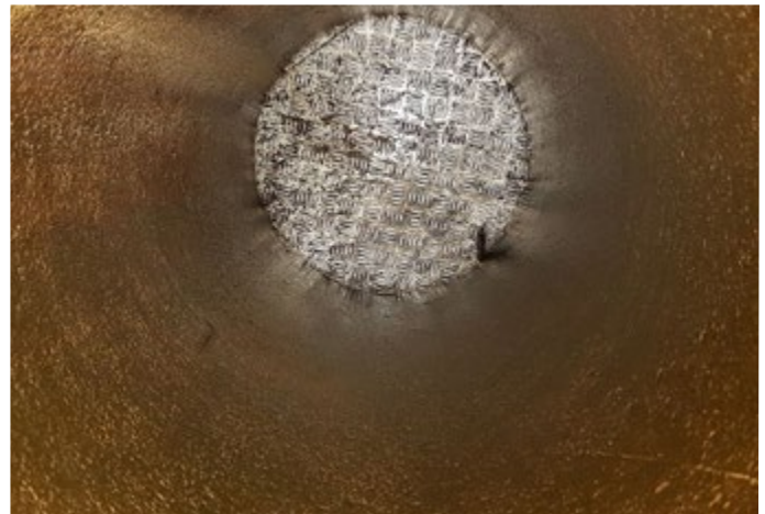
Internal coating of adapter pipe, after 10 years of operation

Are you searching for reliable corrosion protection for specific environments?