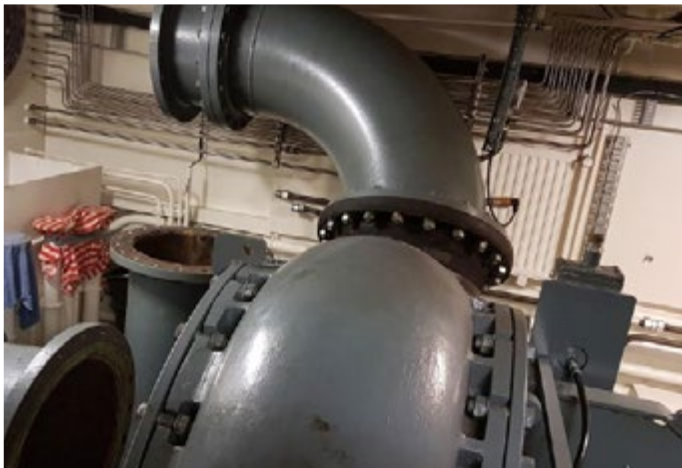
90° elbow pipes, engine room