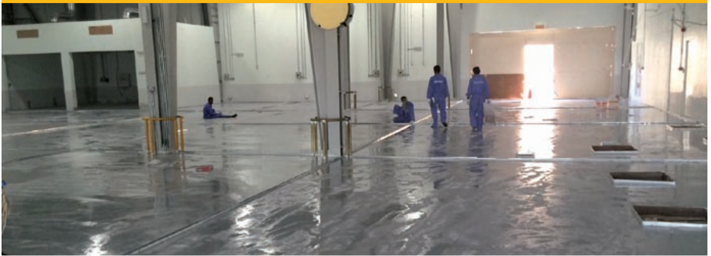
Applied coating in the car workshop